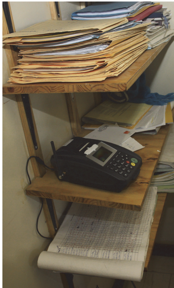
Fig 3. Mobile SMS printer in use. Printer is installed in an exam room of a study antenatal clinic.