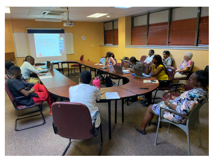
Tumor Board meeting

woman with humeral fracture and leg weakness" and "A 40-year-old with facial swelling, lymphadenopathy and history of treated tuberculosis" on February 27 and March 26, 2024 respectively.