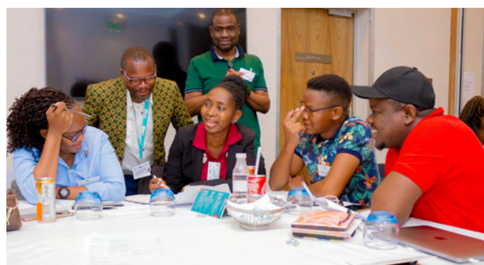
Breakaway group discussions